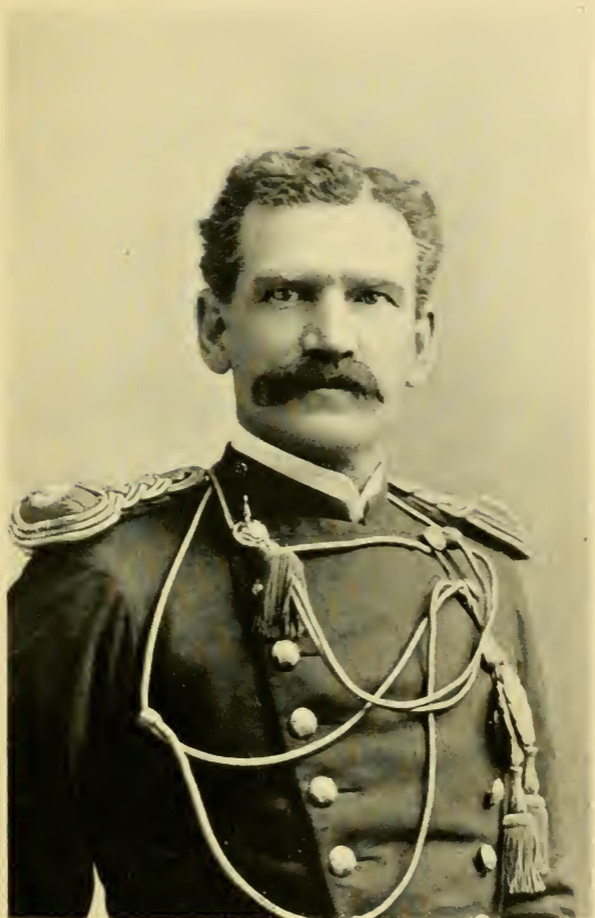
BRIGADIER-GENERAL A. R. CHAFFEE, U. S. V.